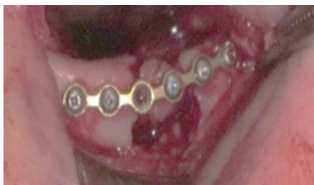
Fig.1. Condition during the titanium plate installation operation.

period, after stabilization of the condition. In stable patients, operations were performed in the first two days in 27 (56.2%) victims, up to 7 days – in 8 (16.6%), up to 14 days – in 10 (20.9%) and after two weeks or more – in 3 (6.25%) patients (Figure 2).